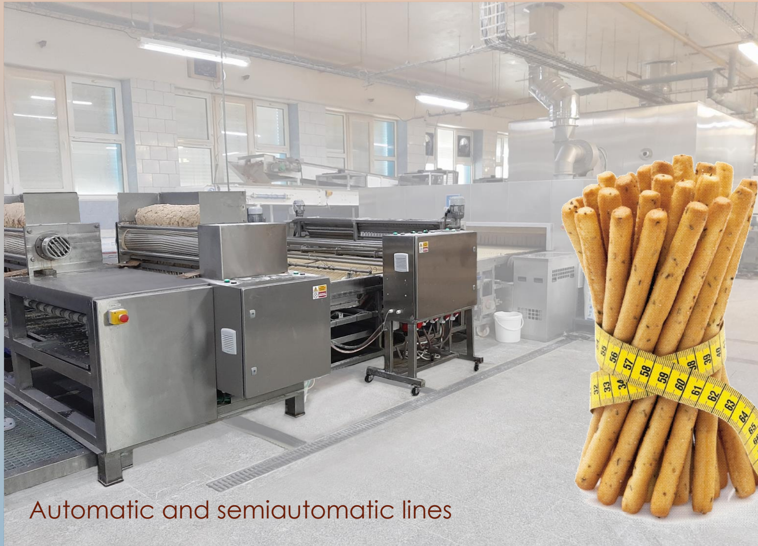
Automatic and semiautomatic lines