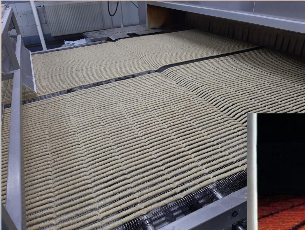
Tunnel oven infeed