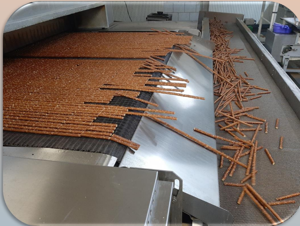
Tunnel oven output