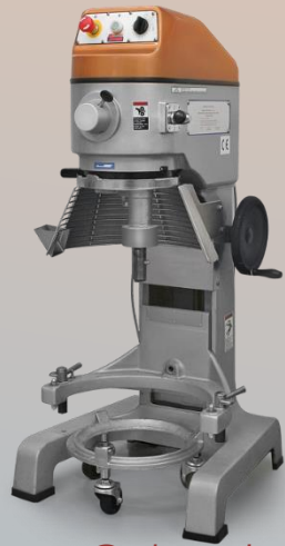
Sponge Cakes dough mixing