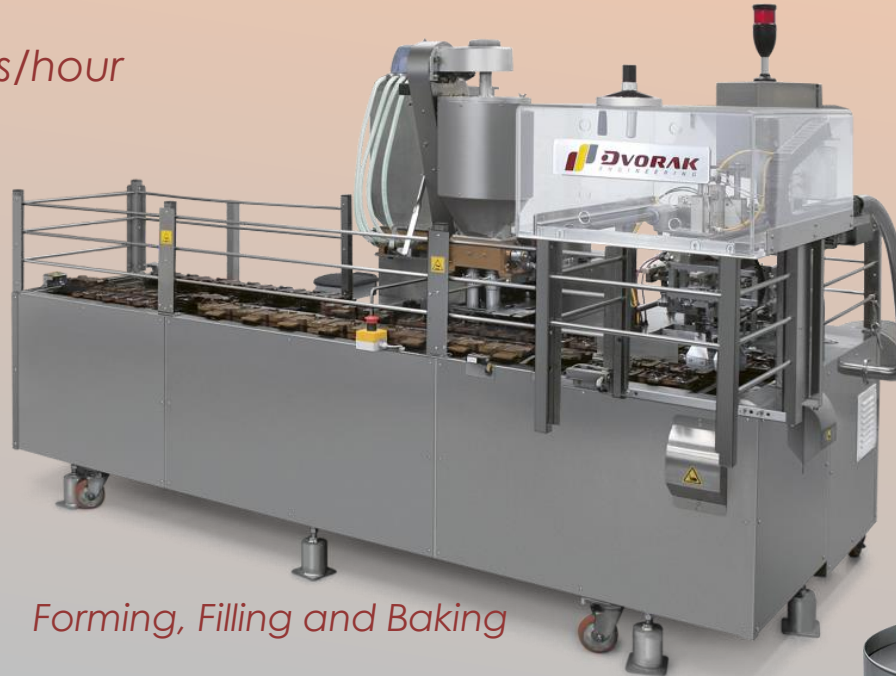
Forming, Filling and Baking