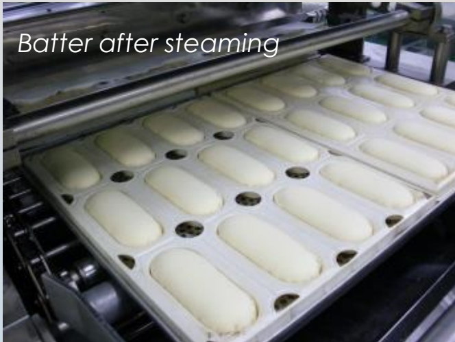
Batter after steaming